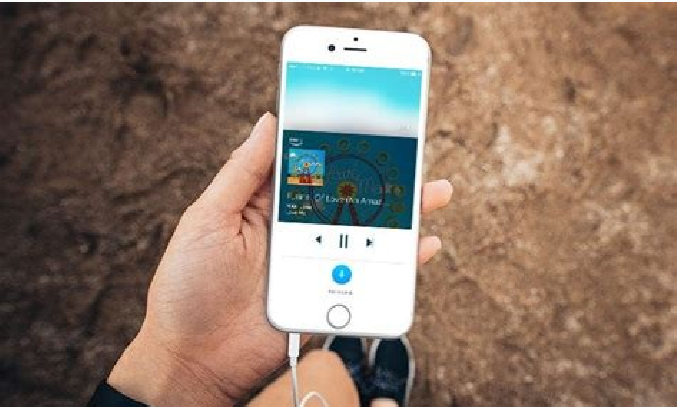
How to connect echo show to alexa app on iphone. How to pair alexa echo with iphone.